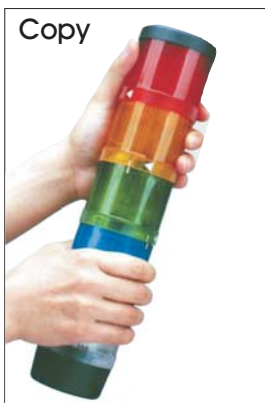
The comparison: products from WERMA (left) and the Chinese company (right)

By "copying" innovative solutions or designs from original manufacturers product pirates succeed in saving on costly investment in research and development. As a consequence their products are significantly cheaper. Product pirates also profit from the manufacturer's brand image. WERMA is also currently faced with such brazen product pirates!